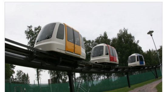
Pod Cars, here on a test track in Uppsala, Sweden, were the subject of a conference last week at Cornell. "The U.S., of all countries in the world, really needs it," one proponent said.

ITHACA, N.Y. — With its rolling hills, scenic waterfalls and ecologically minded college students, this Finger Lakes city can sometimes seem a green oasis.