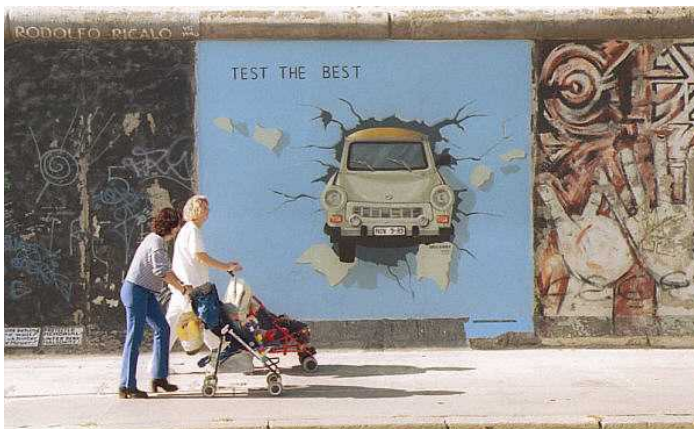
East Side Gallery: a remaining part of the Berlin Wall