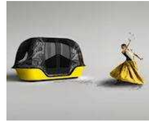
Left: The Golden Temple Above: Proposed Pod Design for Amritsar PRT System