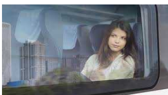
Siemens promotional for Innotrans

After opening remarks, operating experiences at Morgantown and three recent projects will be reviewed. Four breakout sessions will deal with new podcar technologies, plans (Amritsar, San Jose, Uppsala), energy and expanding services. With that global overview, discussions will turn to investment matters – how to strengthen them, how they interface with real estate markets.